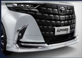
Front Skirt Modellista*

*Image shown are for illustration purpose only.