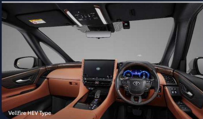
Vellfire HEV Type

Discover elegant ways to enhance your environmental contribution and enjoy a luxurious experience by exploring numerous new paths with Toyota All New Vellfire HEV.