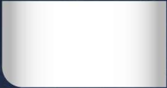
Platinum White Pearl