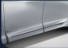
Side Skirt Modellista*