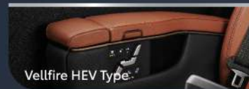
Vellfire HEV Type

Provide a Multifunction Table to support your productivity, complete with Detachable Smartphone-like remote control.