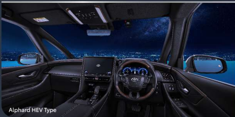
Alphard HEV Type