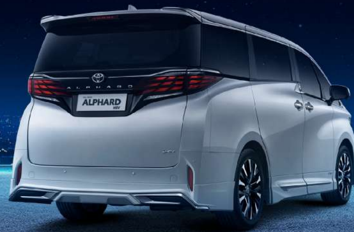
2.5 HEV Type*