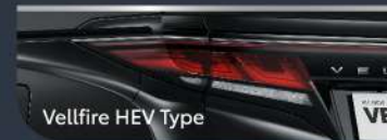
Vellfire HEV Type

The Vellfire emblem detail are designed to strengthen the extravagance look on every journey.