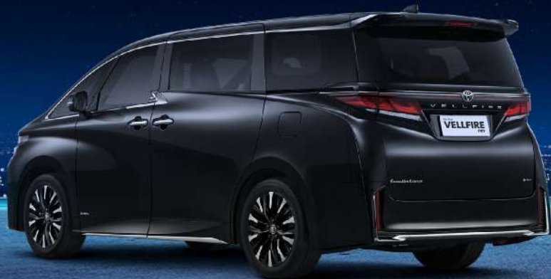
Vellfire 2.5 HEV Type