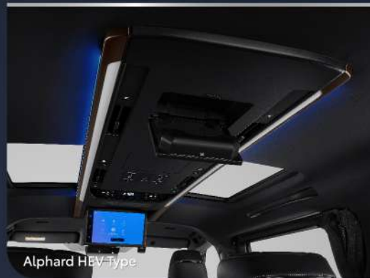
Alphard HEV Type

The luxurious design and advance features including Steering Wheel, MID, Head Unit Display (G & All HEV Type), and DVR (G & All HEV Type) to satisfy you in every drive.