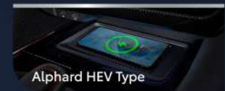
Alphard HEV Type

An entire digital display to serve all essential information about your vehicle. (All Type)