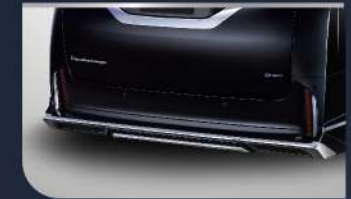
Rear Skirt Modellista**

*Available for Toyota All New Alphard All Type.