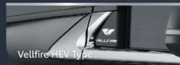
Vellfire HEV Type

Bring out the bold look to the surroundings in all ways.