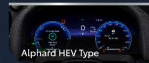
Alphard HEV Type

Provide an extra Front Seat Storage to accommodate your needs. (All Type)