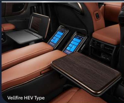
Vellfire HEV Type

Create a sense of ambience through the classy Interior Design, including the Steering Wheel, 12.3" TFT MID, 14" Head Unit Display, and Wireless Charger.