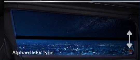
Alphard HEV Type

Experience convenience throughout every journey on Captain Seat (All Type) supported Detachable Smartphone-like Remote Control (All HEV Type) for private ambience and adjustable Rear Side Shade. (All Type)