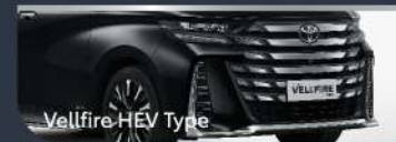
Vellfire HEV Type

Take your journey enjoyment to the next level with Power Long Slide Seat.