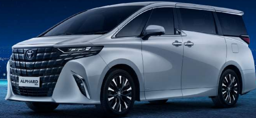
2.5 HEV Type

Experience sophisticated feeling in every path with Toyota All New Alphard HEV and bring sustainable impact for environment.