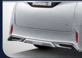
Rear Skirt Modellista*