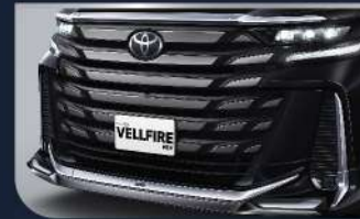
Front Skirt Modellista**