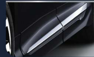
Side Skirt Modellista**